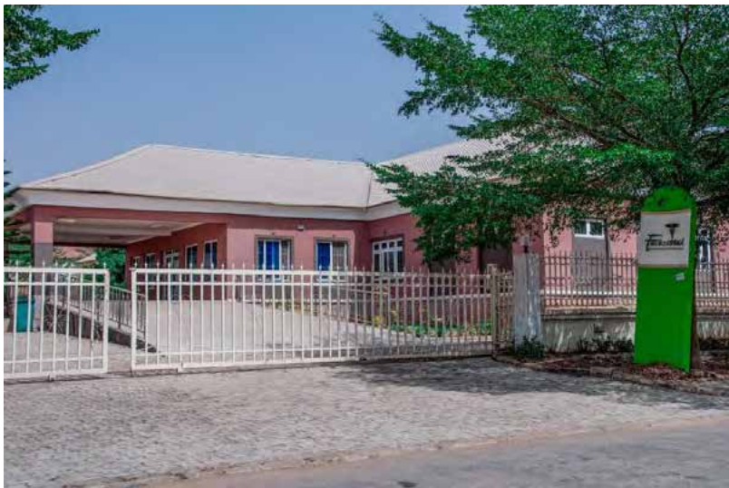
Fort Royal Medical Centre