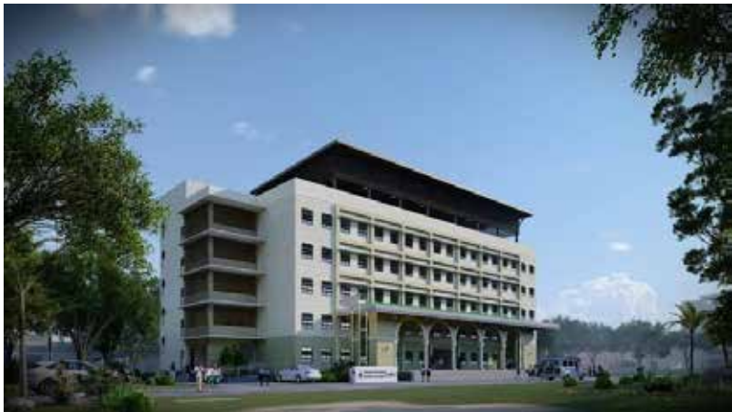
Fort Royal Academy (Nursery, Primary & Secondary)