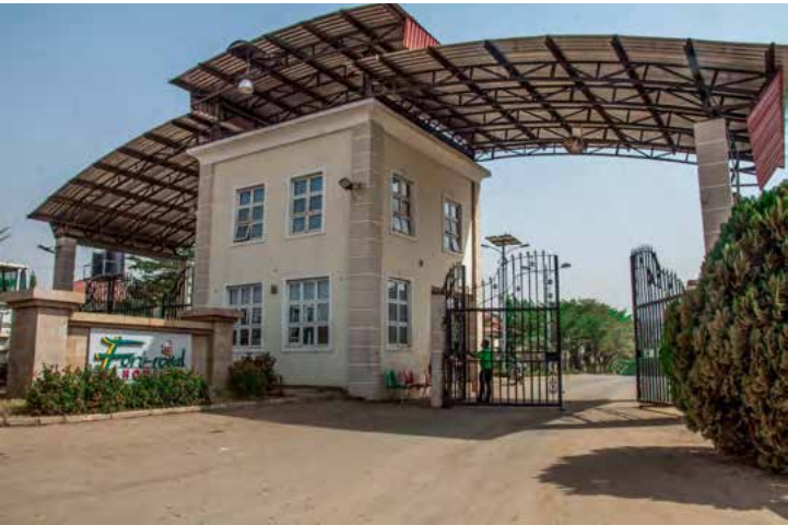
Estate Entrance with Security